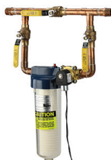
Master Water Control Valve